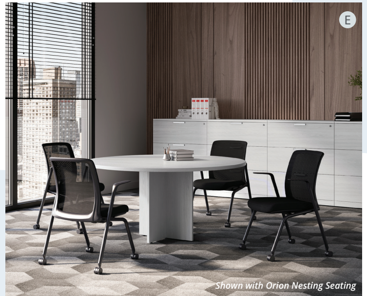
Shown with Orion Nesting Seating