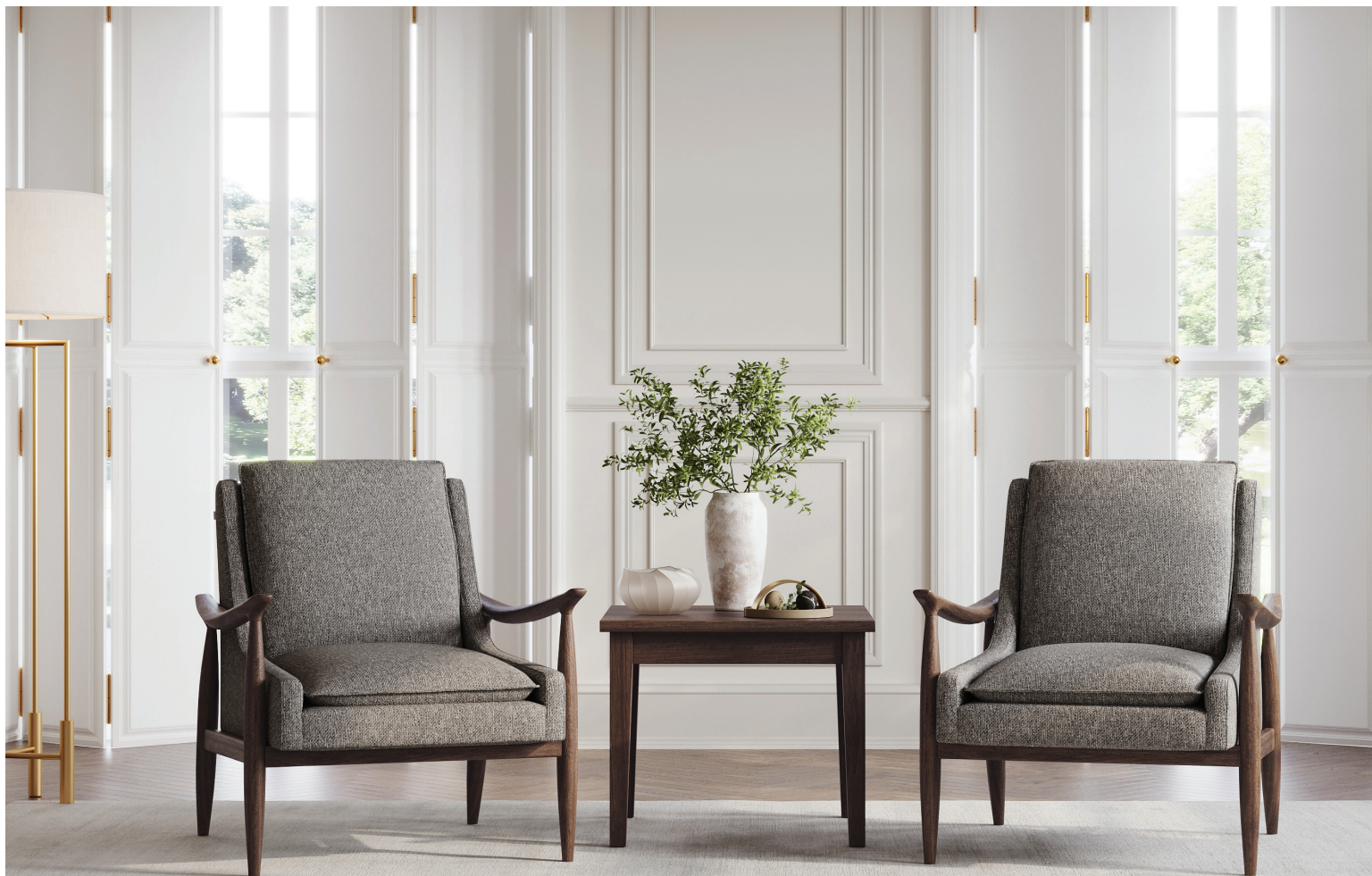
Shown with Mira Seating