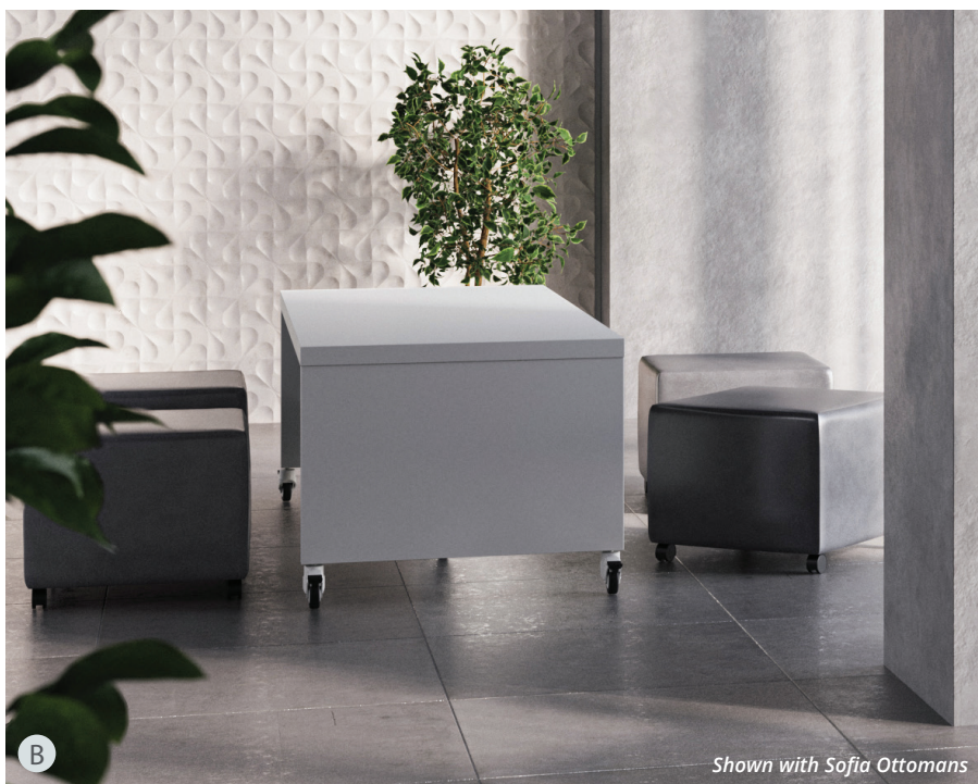
Shown with Sofia Ottomans