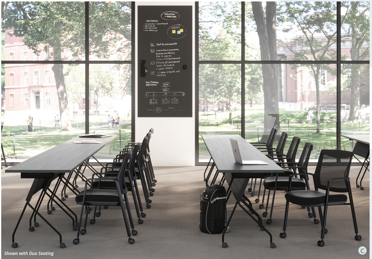
Shown with Duo Seating