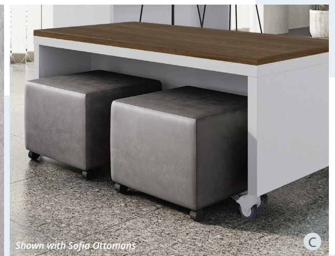
Shown with Sofia Ottomans