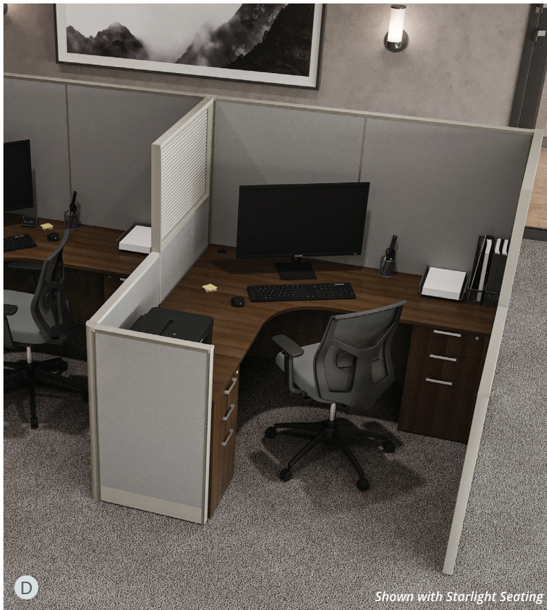
Shown with Starlight Seating