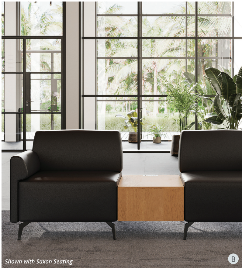
Shown with Saxon Seating