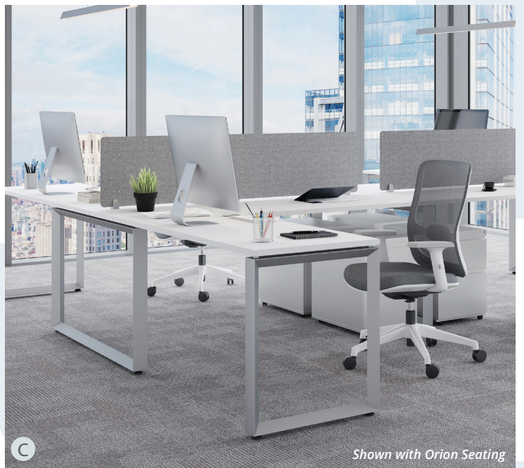
Shown with Orion Seating