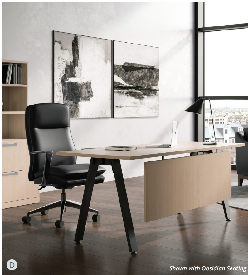
Shown with Obsidian Seating