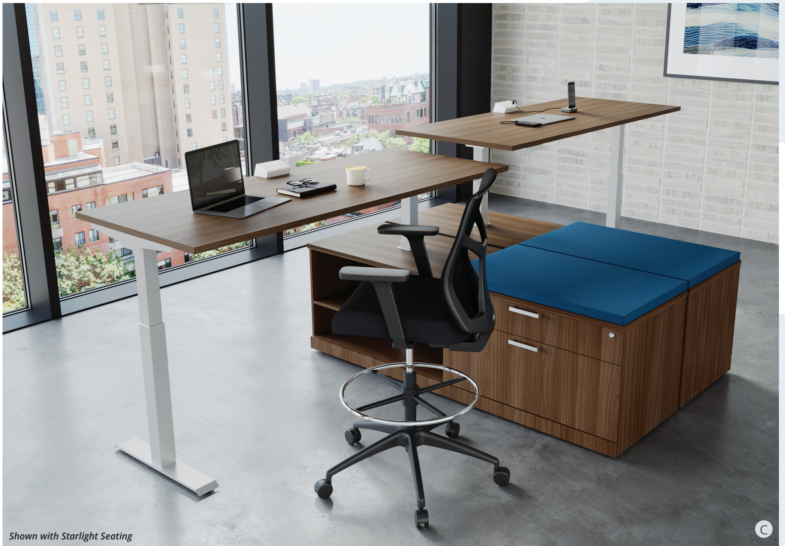
Shown with Starlight Seating