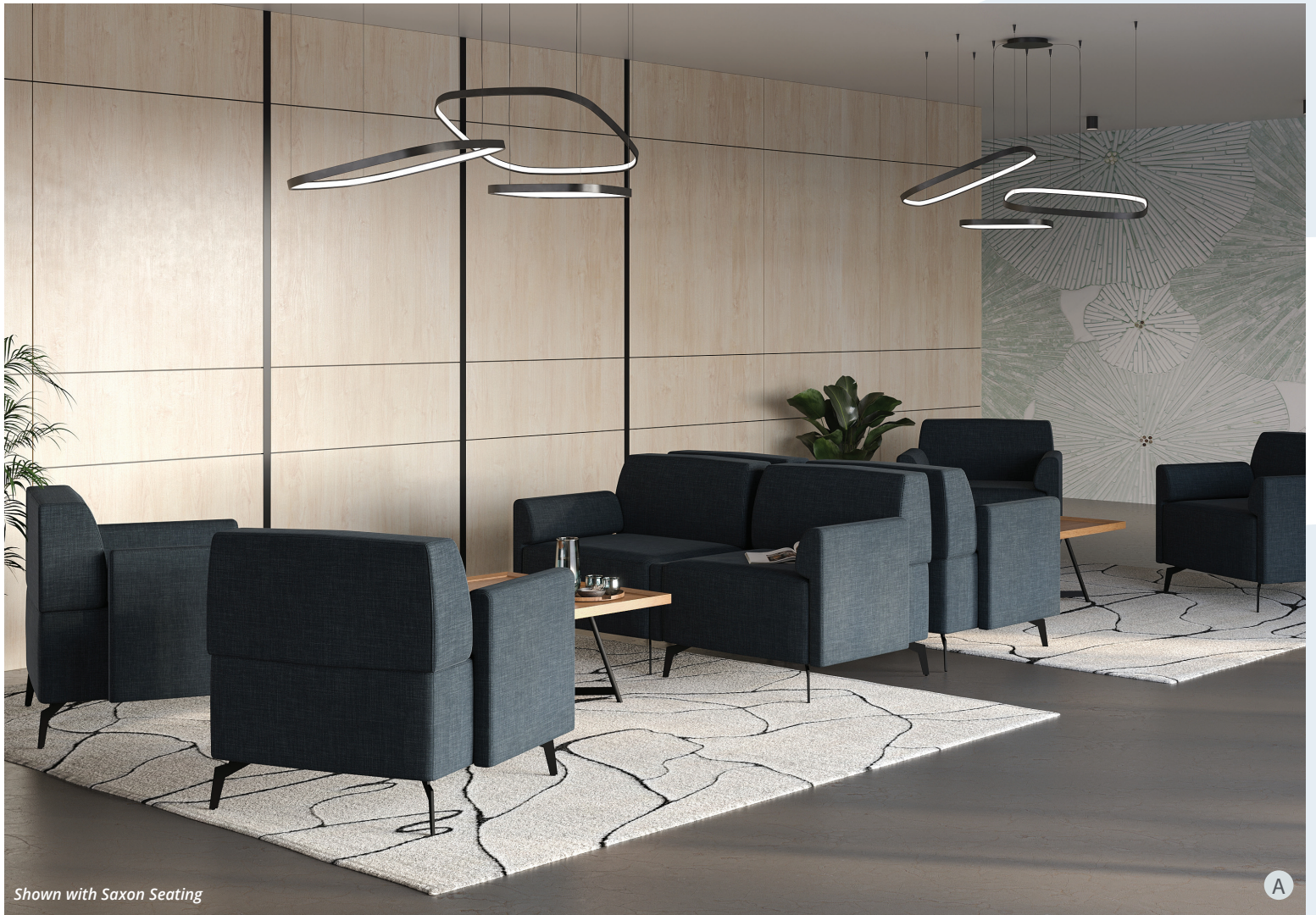
Shown with Saxon Seating