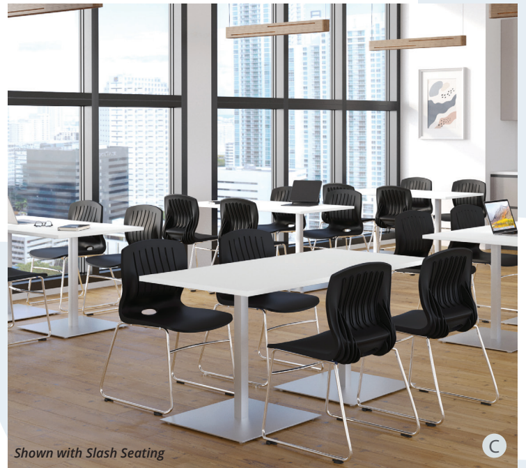
Shown with Slash Seating