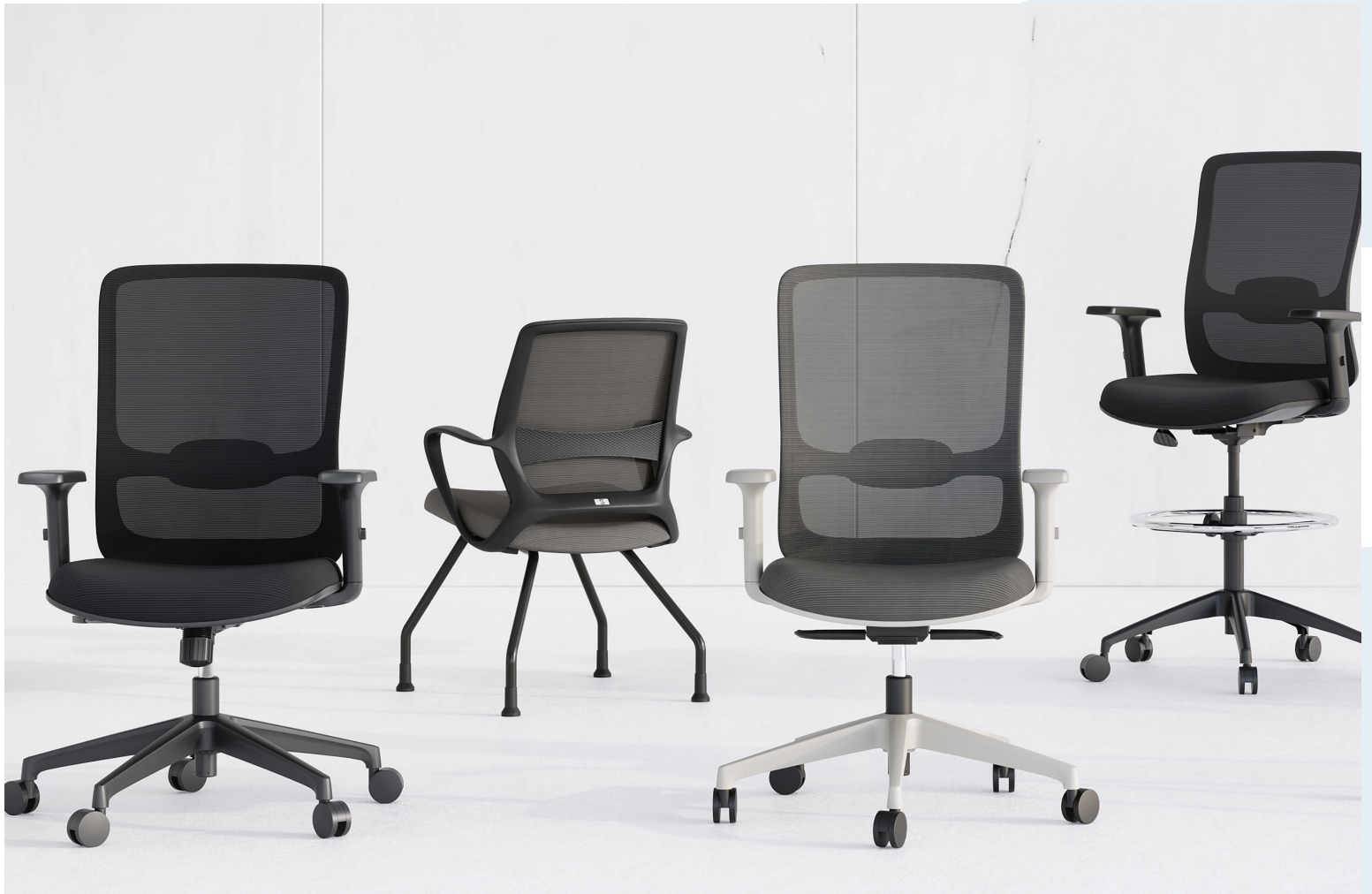
Shown with Orion Seating