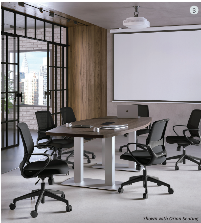
Shown with Orion Seating