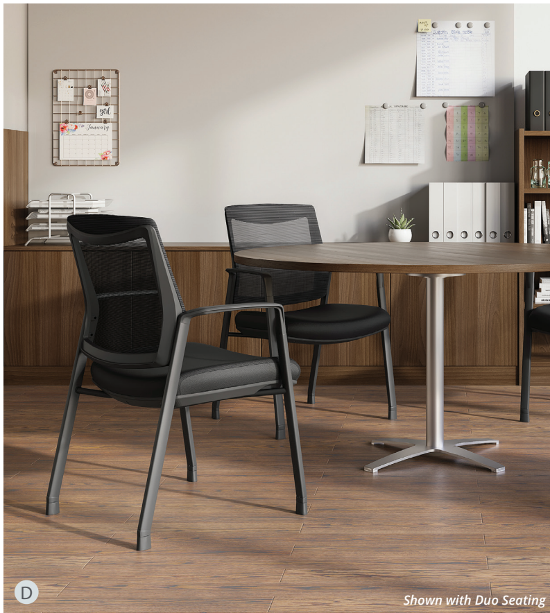
Shown with Duo Seating