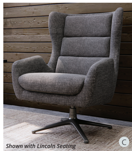
Shown with Lincoln Seating