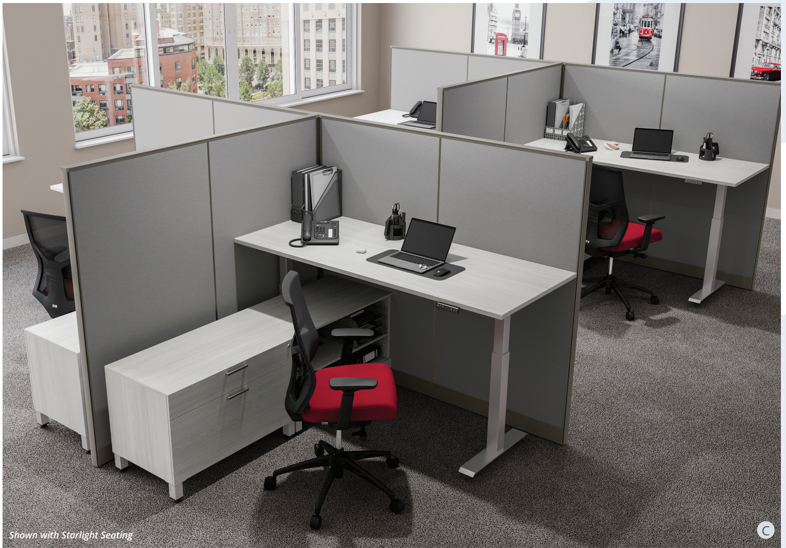
Shown with Starlight Seating