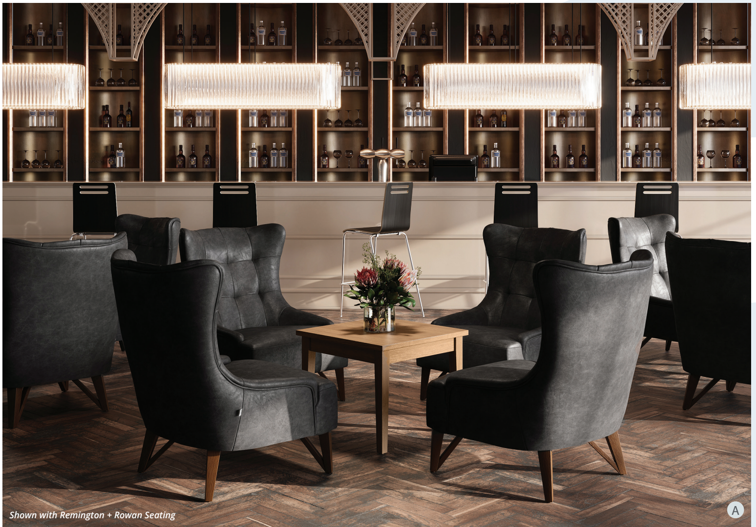
Shown with Remington + Rowan Seating