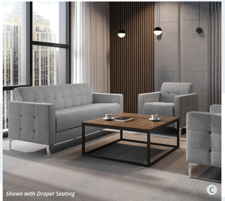
Shown with Draper Seating