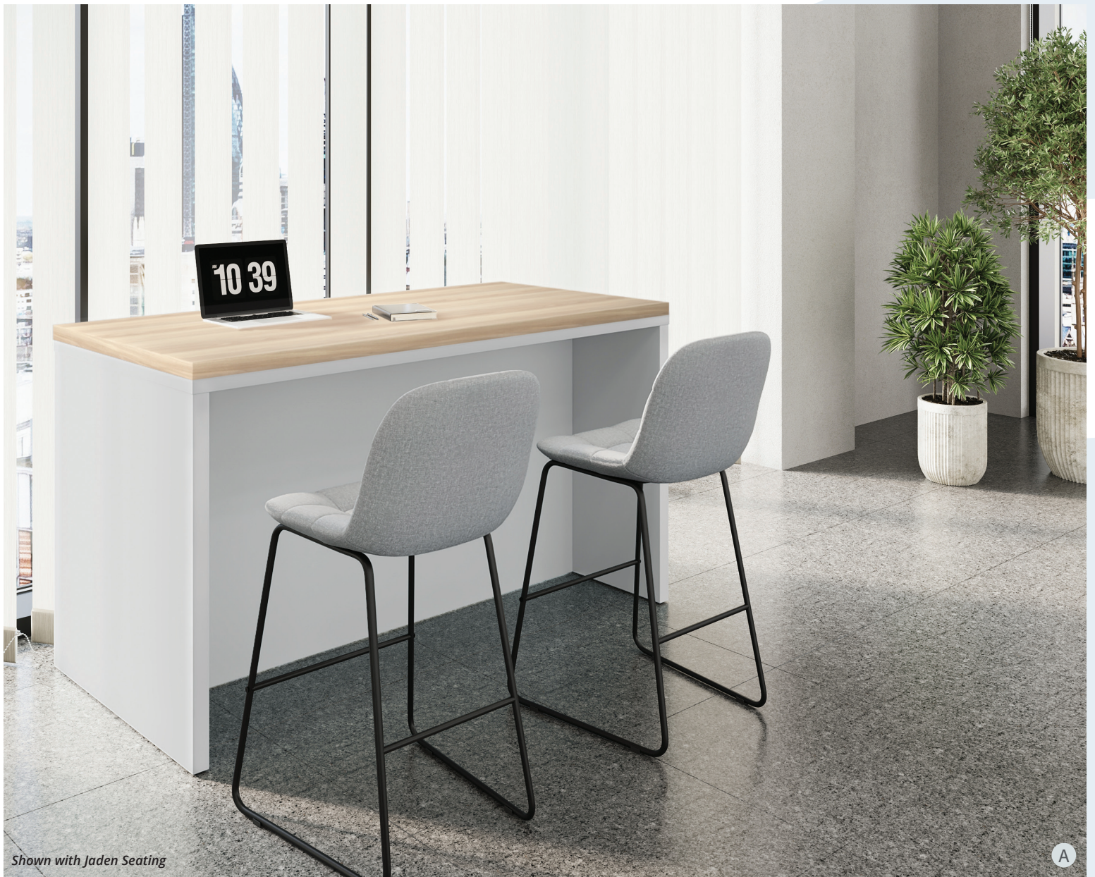
Shown with Jaden Seating