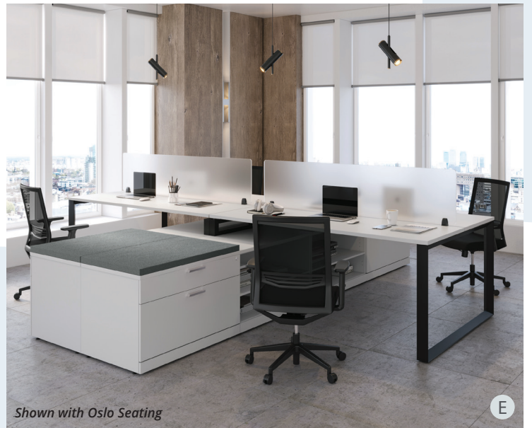
Shown with Oslo Seating