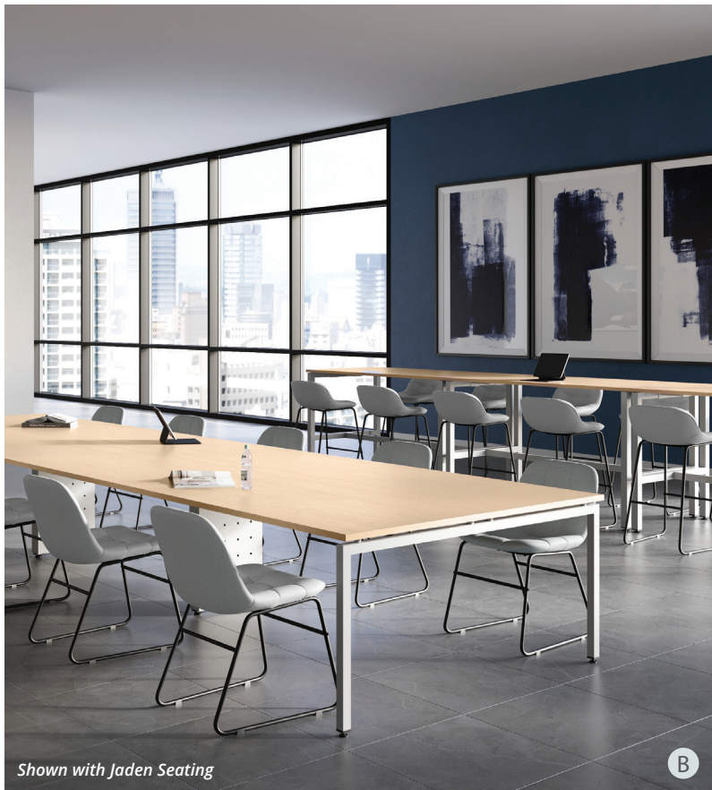
Shown with Jaden Seating